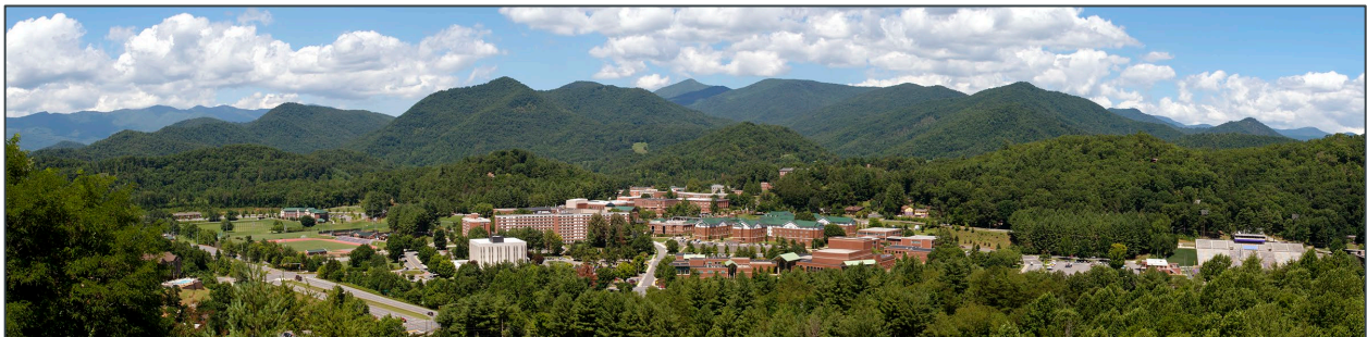
Western Carolina University, Cullowhee, NC