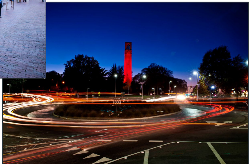
Top: University of North Carolina at Chapel Hill, Chapel Hill, NC; bottom: North Carolina State University, Raleigh, NC