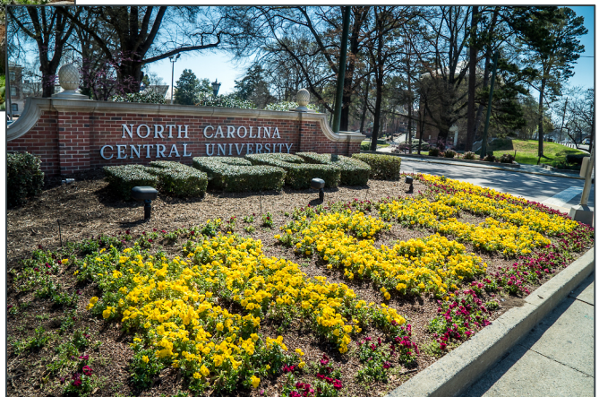
North Carolina Central University Durham, NC