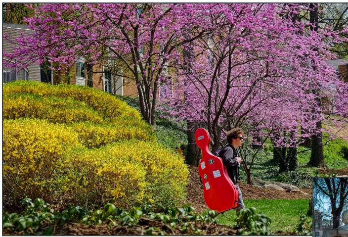
University of North Carolina School of the Arts Winston-Salem, NC

The Associate Vice President for Strategy and Policy will serve as the Deputy to the Senior Vice President for Strategy and Policy. The Associate Vice President will play a lead role in the design, implementation, and management of System-level projects, including the System's performance measurement and accountability framework and the work of the Board of Governors Committee on Strategic Initiatives.